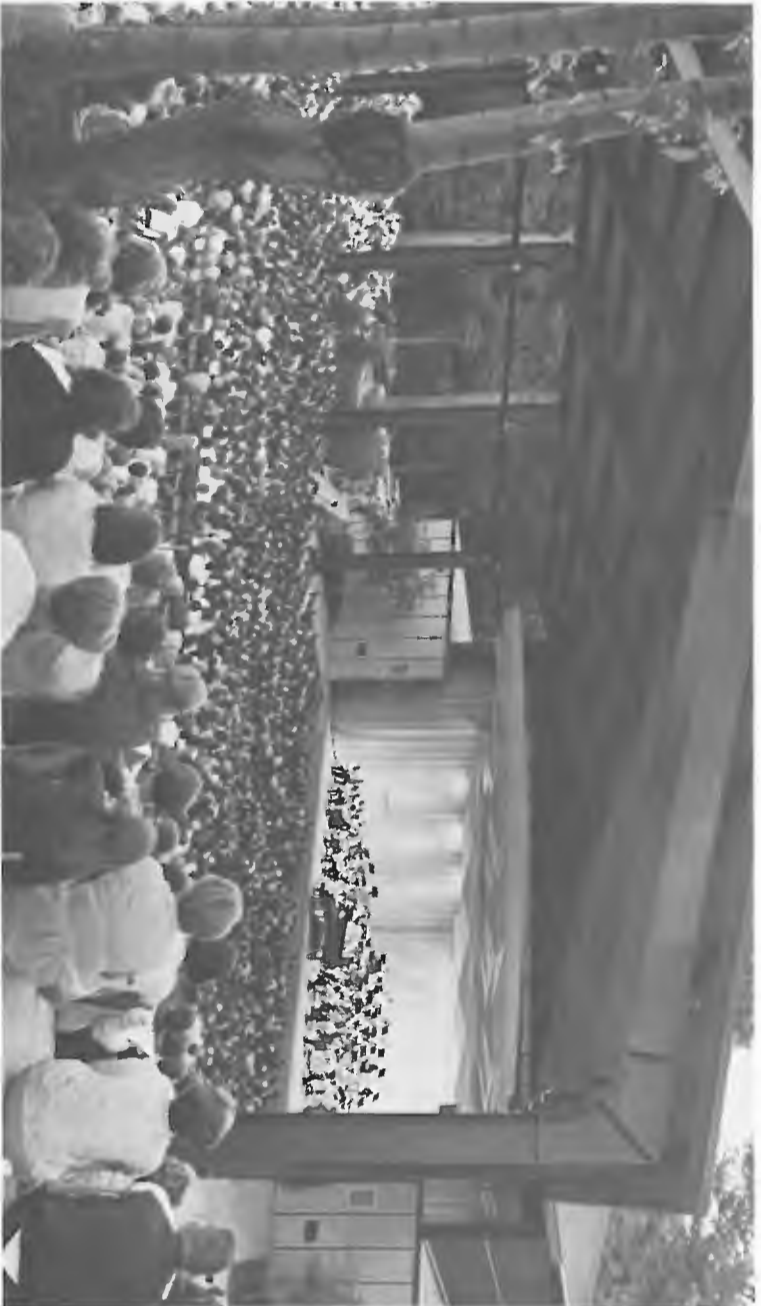
Howard C. Baldwin Memorial Pavilion