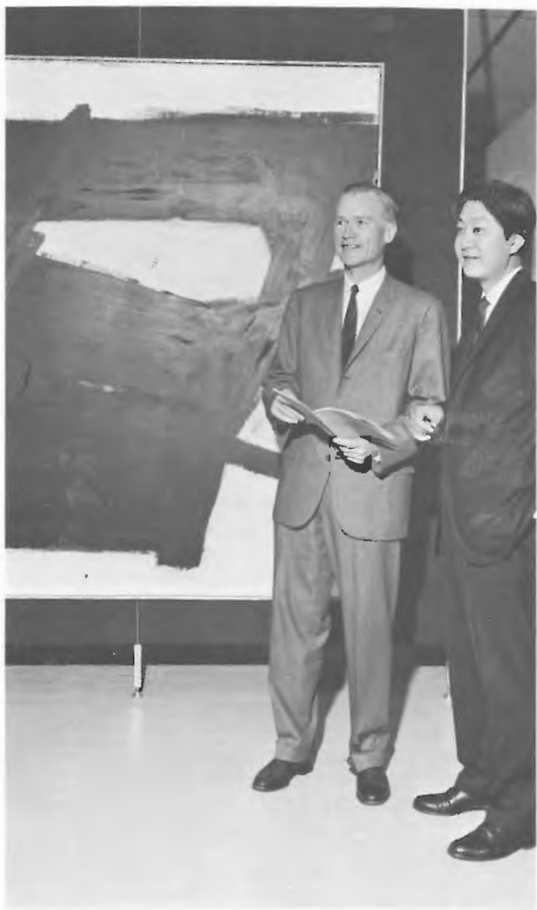
Richard Brown Baker Collection—University Art Gallery, 1967