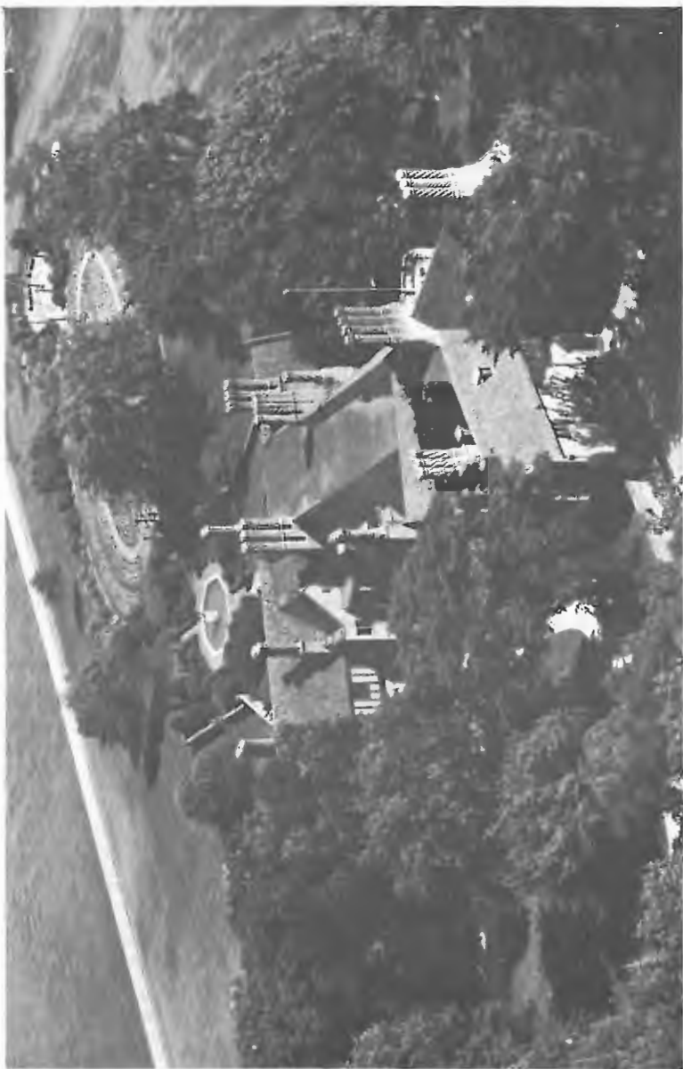
Meadow Brook Hall