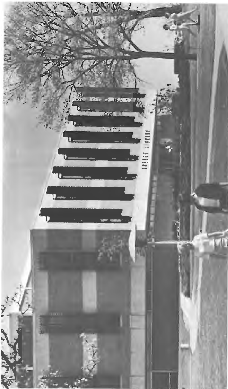
The Kresge Library