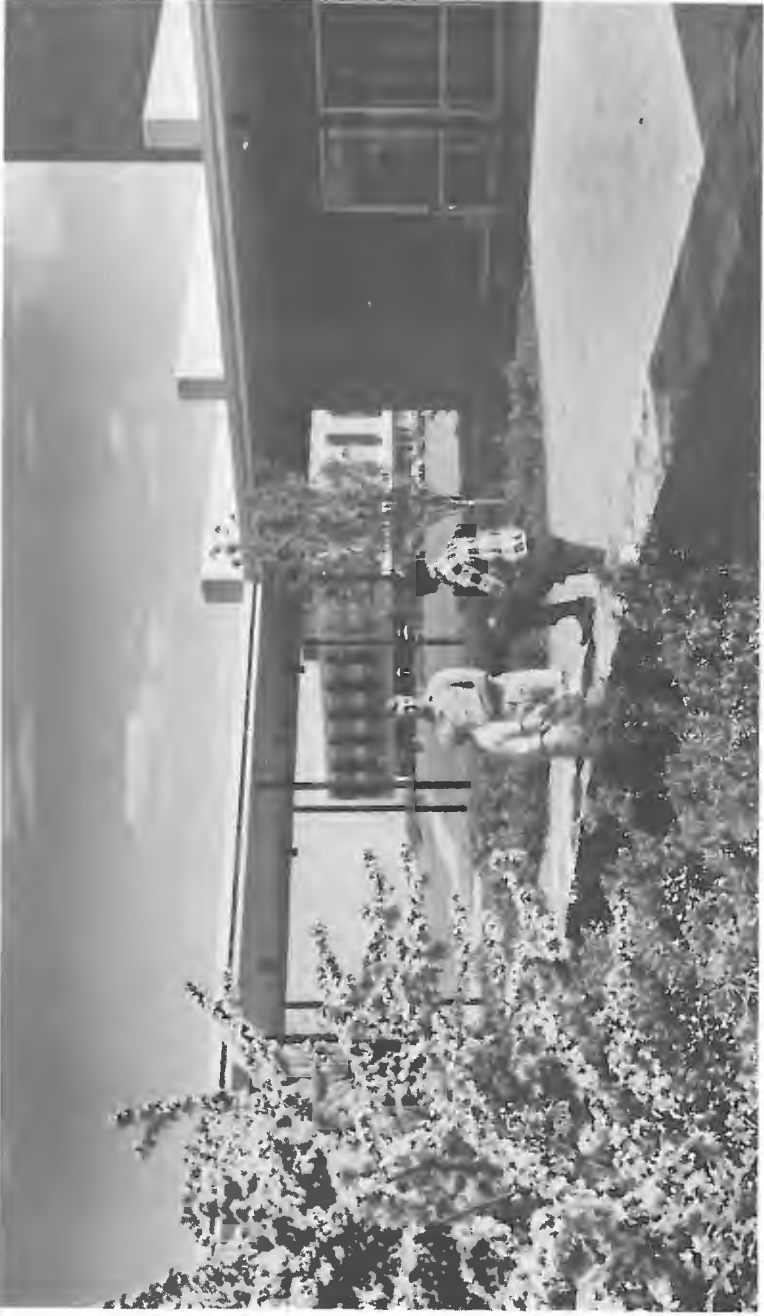
Foundation Hall Loggia