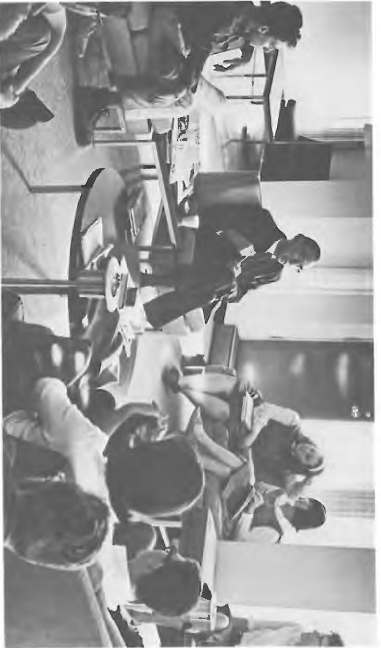
David Riesman, Harvard University Sociologist, visits with students