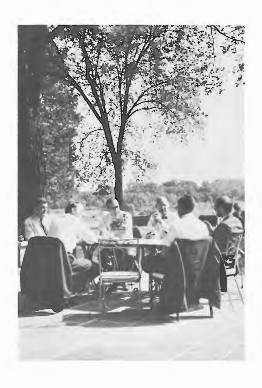
National Science Foundation Conference at Meadow Brook Hall